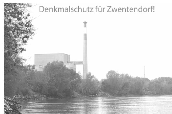
Historical monument Zwentendorf: A nuclear ruin is the symbol of the classical era of Austrian environmentalism.

Eventually, a ban on nuclear power generation was written into the Austrian constitution. As the Austrian politicians have been doing little to discourage energy waste and to promote energy efficiency and modern alternative energy sources, Austria is now importing electricity from abroad, some of which is nuclear.