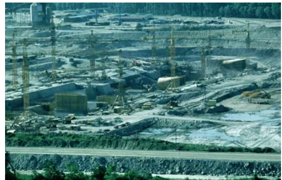
Would it soon look like this? (“Greifenstein” hydro plant Construction site)

Around Christmas of 1984, and after a last bloody attempt to expel the protesters from the Au, the government caved in and proclaimed a 1-year moratorium on construction work. This moratorium lasted for 12 years. In 1996, on the occasion of Austria’s millenium celebrations, the Hainburg area was declared a national park and “given to the Austrian people as a present.” 16