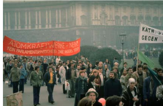
Red flags and Catholic banners and lots of otherwise apolitical citizens – a large cross-section of Austrian society were galvanized into activity against the nuclear power plant

subsequently cancelled was placed in 1974. When George W. Bush announced a renaissance of nuclear power, potential US investors immediately demanded huge government subsidies. As yet, no new nuclear plant is under construction in the USA.