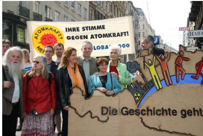
"The story continues" – 30 years after the referendum

government has tolerated this kind of direct action, but is only half-heartedly negotiating with the Czech government – originally as to a phase-out 71 of their nuclear power program, and now as to enhanced safety systems. The option of vetoing Czech accession to the EU was never seriously considered. 72 Instead, in 2000 Austrian negotiators got the Czechs to promise in the Melk Agreement to commission an environmental impact assessment, to upgrade Temelin's inadequate safety systems, and to immediately inform 73 the Austrian authorities in the case of an incident. According to critics, the Czech Republic is not honouring these undertakings. Today, the Temelin nuclear plant is on line and seems to