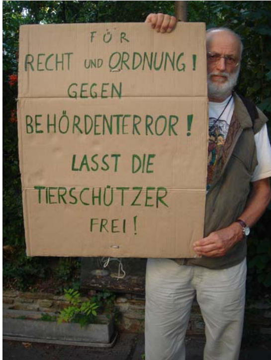
Protest for law and order and against state terror

enemies among intensive livestock farmers, amateur shooters, and fashion outlets that still sell fur products.