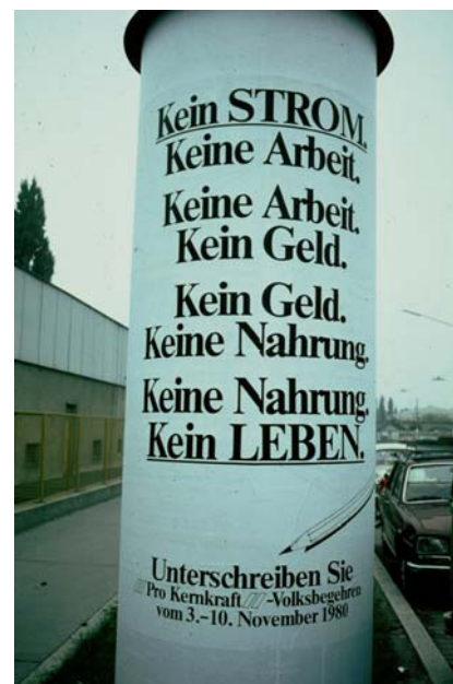
"No life without nuclear power ..."

Therefore, the then chancellor (prime minister) Bruno Kreisky decided to hold the first referendum in post-war Austria. (The second would be the 1995 referendum on joining the European Union). Kreisky was confident he would win because the Zwentendorf plant was already sitting there and just waiting to go on line and because the government, the Industrialists' Federation, and the Labour Unions had each spent 30 million schillings on pro-nuclear propaganda