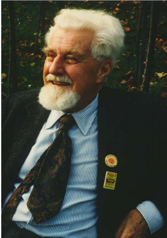
After playing a decisive role in the nuclear controversy, Nobel laureate Konrad Lorenz became the figurehead in the successful fight for the preservation of the Hainburg wetlands.

Early environmental controversies had been of a local or regional character. The Zwentendorf referendum had been on a national level, and the Hainburg crisis had reached international proportions: Journalists from all parts of the world came to report on the skirmishes, and Prince Philip came from Great Britain in his capacity as president of the WWF.