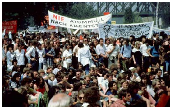
"No nuclear waste to the Waldviertel ..."

By the mid-70s opposition was slowly emerging and to counter it, the Austrian utilities started their first horror scenario campaigns with posters depicting dark streets, little children with candles, and helpless doctors in front of cold incubators. For without nuclear power "the lights would go out." By 1978, construction of the plant was completed, but opposition had grown and become a burden on the ruling Social Democrat Party.