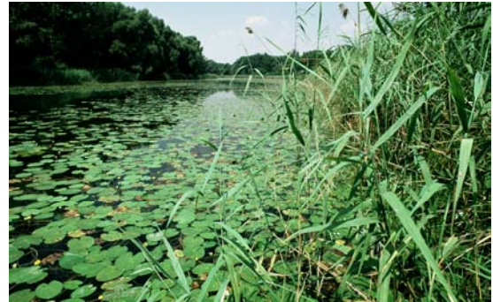
The “Au” in its natural state

getting involved, news of the authorities’ actions mobilized thousands of hitherto indifferent citizens who would not normally have dreamt of exchanging their cosy homes for a tent on a cold December night.