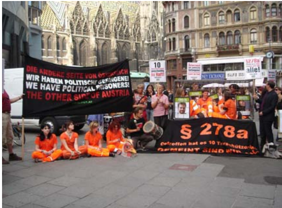
Protest against the law that can be abused to suppress NGOs

Under an obscure law created in the wake of 9/11, which requires a minimum of ten suspects to prove the existence of a “criminal organisation”, exactly 10 people were arrested. Some of them did not even know each other. The prisoners were not released for several months, and all unsolved animal rights-related unlawful acts that had been committed during the last decade 114 were simply put on them.