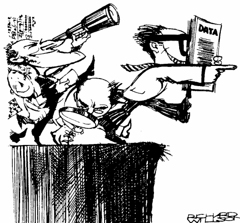
Experts at Work