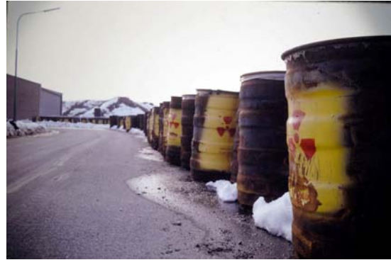
Nuclear waste from the research reactor at Seibersdorf in Lower Austria, 1960s. The waste problem is still as unresolved now as it was then.

9 The nuclear lobby claims that finding waste disposal sites is just a "political problem". For the USA, Yucca Mountain in Nevada had long been under consideration as the central federal nuclear waste repository, but scientists' concerns and fierce local opposition had prevented the project over decades. With the same determination that some people admired when he decided to invade Iraq, President G.W. Bush solved that political problem with a stroke of the pen, forcing the people of Nevada to give up their opposition, and presumably