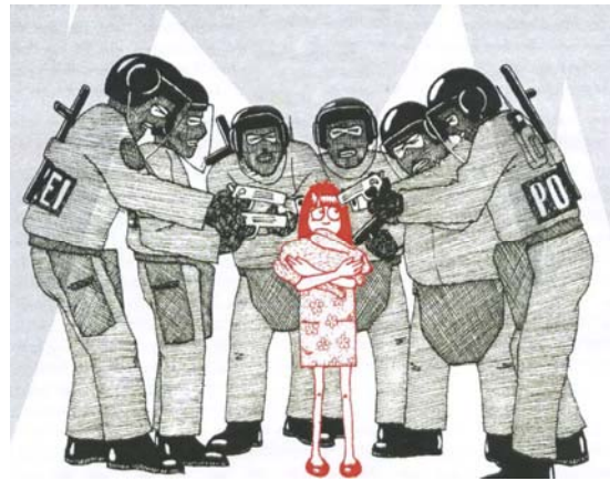
Girl with Rabbit. Cartoon: Franz Gratzner

In an unprecedented Rambo-style police raid which many observers thought was shockingly disproportionate, anti-terror police units stormed several dozen flats and offices of animal rights activists and humane societies in May 2008. Although telephone lines had been tapped for months and the police therefore knew that they had to expect zero resistance, they kicked in doors, forced people at gunpoint and in full view of small children to stand half-naked for hours, handcuffed them, ransacked offices, and took away computers and office property. 113